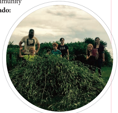
Working on the Prairie