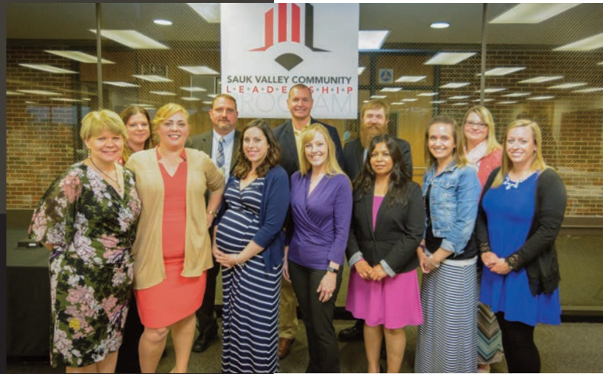
Sauk Valley Community Leadership Program inaugural graduating class 2017

Sauk continues to expand relationships with local organizations, businesses, and educational institutions.