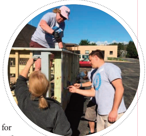
United Way Day of Caring