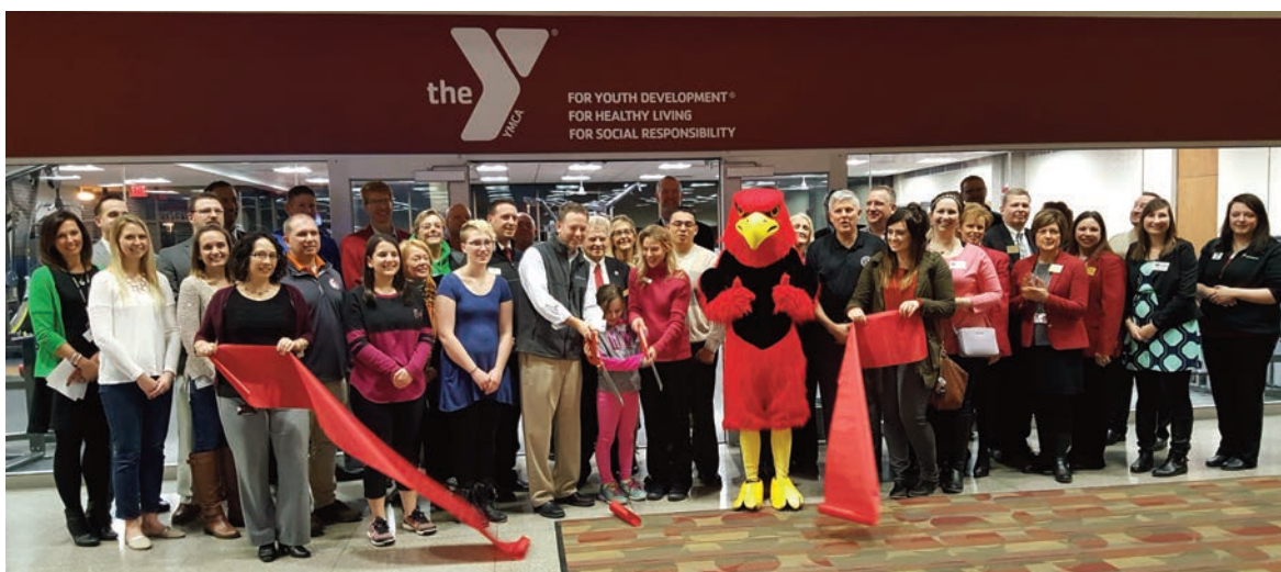
Sauk YMCA & Follett Bookstore ribbon cutting jointly hosted by SVCC and the Rock Falls, Dixon, and Sauk Valley Area Chambers of Commerce