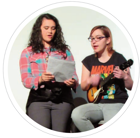
Fine Arts Performance Hour

From Tony Award-winning plays, to hypnotists, to singers breaking onto the national stage, Sauk has a little something for everyone. Check out our calendar of events on the Sauk home page, svcc.edu .